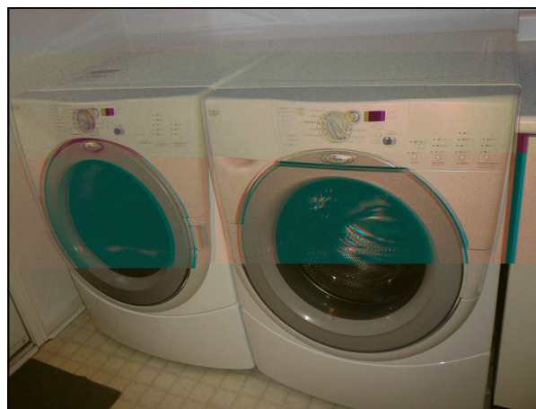
“Whirlpool” Frontload Washer & Dryer