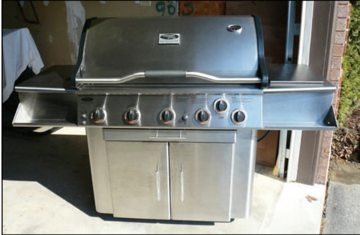
“Vermont Castings” Stainless Steel BBQ