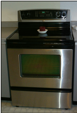
Stainless Steel Self-Cleaning Oven